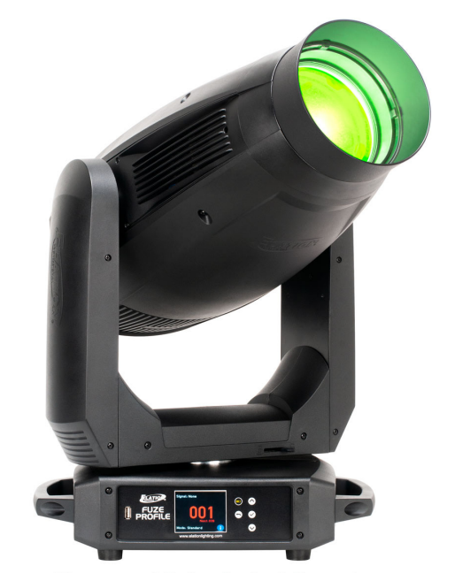
Shown with included Snoot

The FUZE PROFILE is designed for any application where fully automated ellipsoidal fixture with outstanding and impactful color range and quality is required. A rotating gobo wheel, fixed gobo wheel, animation wheel, frost, prism and iris round out its comprehensive feature set in a compact, quiet and lightweight fixture.